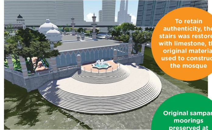
Grand Staircase After - Restored to its full glory

To retain authenticity, the stairs was restored with limestone, the original material used to construct the mosque