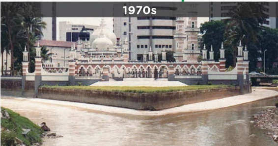
View of the Grand Staircase in the 1970s