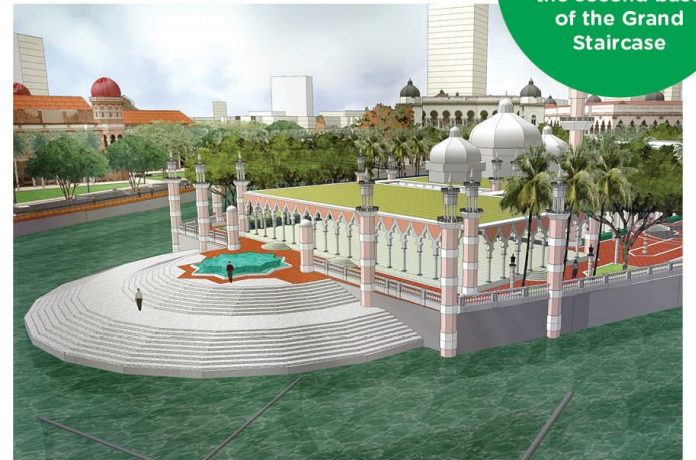
Artist impression with flooding of the Grand Staircase

In 2014, the concrete embankment was stripped away to reveal the Grand Staircase