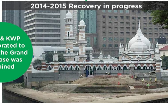
2014-2015 Recovery in progress

JWN & KWP collaborated to ensure the Grand Staircase was retained